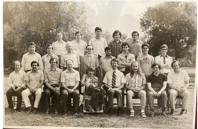
Early Universe Workshop, Cambridge