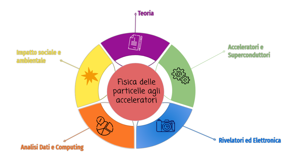
Figure 1: Introductory slide to the project. Particle physics at the accelerator split into the five macro-areas.

The organization started with the subscription and the contents . It was important to understand how to engage and reach young people, but it was not possible to neglect the preparation of the content. It has been decided to involve citizens from 16 to 30 years old to have the possibility to listen to the opinions of high school and university students and maybe some early workers. To subscribe to the project they were required to submit a one-minute video. They were not asked to speak about specific subjects but generically to present themselves and to explain why they were curious about the project. In parallel, the preparation of the contents would proceed by dividing the subject into five macro-areas (see Fig. 1): theory , accelerators and superconductors , detector and electronics , data analysis and computing , and social and environmental aspects .