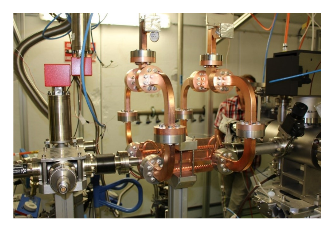
Figure 1: Photo of a CLIC type accelerating structure, able to work at a gradient of 100 MV/m with very low breakdown rate.