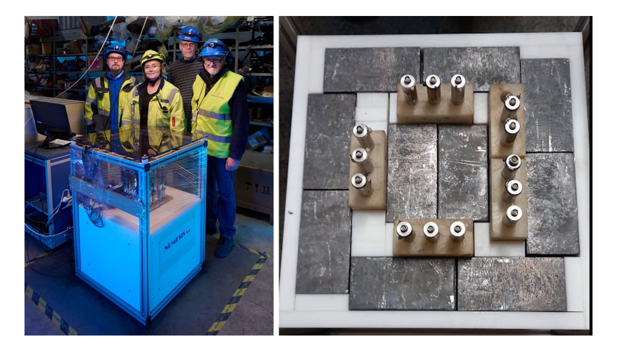
Figure 1. (Left) Photo of the fully assembled NEMESIS 1.4 setup. (Right) Configuration of the target (100 Pb bricks in 10 stacks of 10 bricks each) and fourteen helium-3 counters in PE casting. The picture was taken before adding the electronics, the external PE layer, and protective covers.

Experiments in the Pyhäsalmi mine are the first dedicated attempt at indirect terrestrial DM detection. Our measurements consistently see small but statistically significant excess events in neutron multiplicity spectra from Pb targets. These excess events appear to have peak-like structures, discernible in long-exposure spectra. Such structures cannot originate from muon-induced spallation alone. It is, therefore, possible that the missing contribution comes from WIMP interactions [2].