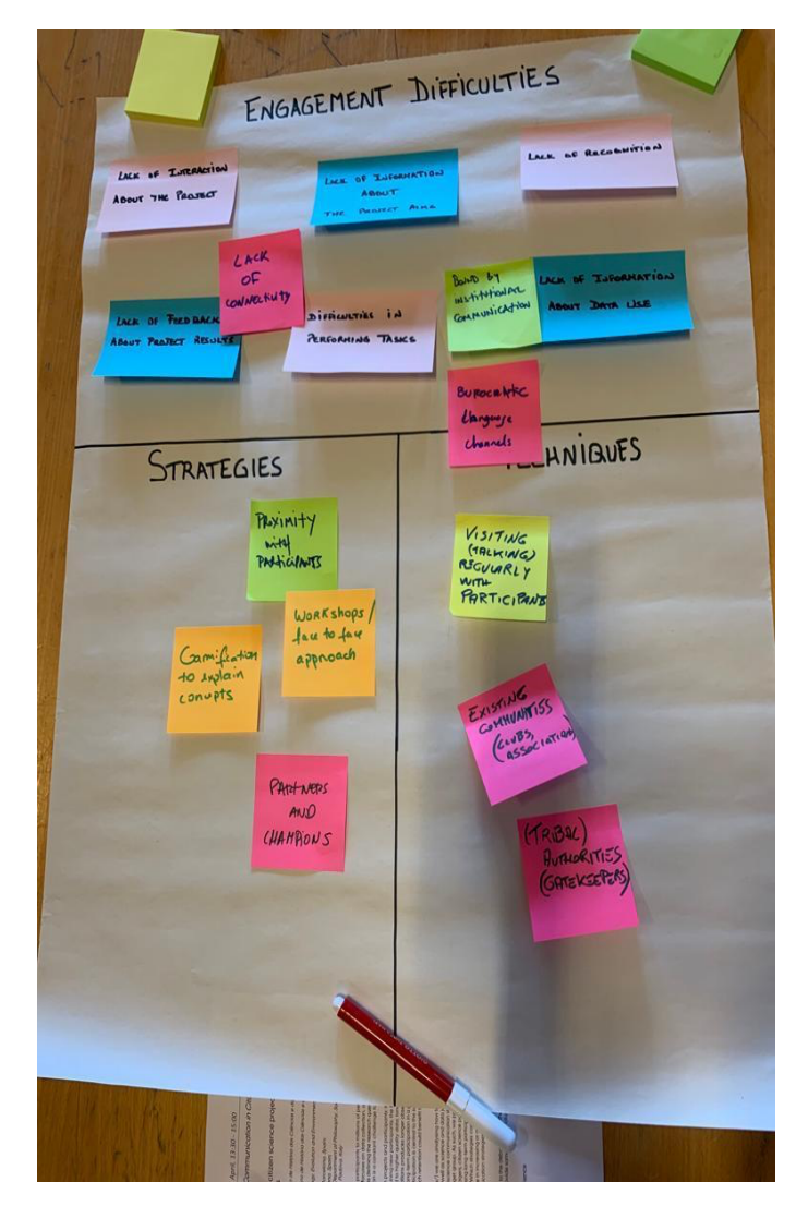
Figure 1: Examples of difficulties in engaging participants in citizen science projects, and of strategies and techniques to overcome these difficulties, obtained from the dialogue roundtable organised.

Regarding the strategies that can be applied to motivate project participants to keep engaged, some were pointed out (Figure 1, bottom left): identifying and understanding the target audience; using the appropriate social media channel; the use of gamification to explain concepts; a partner and champion engagement system; and workshops or other face-to-face approaches.