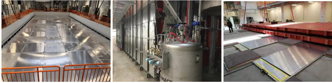
Figure 1: The installed top CRT, side CRT (east side) and bottom CRT surrounded by cryostat. Note: In the middle figure the large tank is a cryogenic pump.

could be used; however, the electronics were not designed to operate at the kHz rates associated with surface running ICARUS detector. Additionally the scintillator had aged enough to cause a meaningful drop in light yield that could impact their performance. Therefore a new SiPM-based photon readout system was developed. In side CRT, each module consists of 1 layer of 20 strips with dimension of 800 (L) x 4 (W) x 1 (H) in cm. Each strip contains a single WLS fiber read out at both ends. Two strips are optically ganged on a single SiPM on each end for a total of 20 channels per module. A single end of three modules is read out by a single CAEN front-end board.