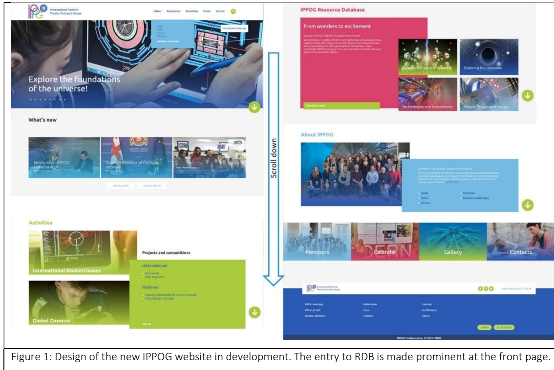
Figure 1: Design of the new IPPOG website in development. The entry to RDB is made prominent at the front page.

After almost 10 years, IPPOG has embarked on an ambitious project to improve the user experience across the IPPOG digital portfolio (websites and social media channels) and to strengthen the IPPOG brand online by creating a new website (see Fig.1) including a new RDB (see Fig. 2). The goal of the new design is to greatly broaden the audience type and use of the web pages and available resources. IPPOG wants the new website to become more open to students, teachers and the general public, and for the RDB to become the primary source of particle physics outreach material in the world [2].