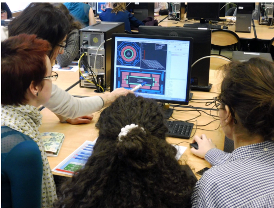
Figure 1: Girls' Masterclass 2017 at APC Paris

To help boost the number of women entering physics careers and to offer girls additional opportunities to collect positive experiences in this field, IPPOG decided to hold special Masterclass events on the IDWGS. This effort started in 2017 [8]. All research labs participating in the regular International Masterclasses program were invited to organize a Masterclass targeting especially girls. 10 research labs followed this call and held an event. Because 11 February was a Saturday, it was difficult for some institutes to hold an event on that day. Therefore activities started already on 10 February and continued on Saturday. A total of 320 girls attended these Masterclasses, a few of which were not exclusively, but also open to boys. All institutes engaged female lecturers and tutors for these Masterclasses, as much as possible, to provide role models for the girls. In addition, all videoconferences held with CERN had female moderators.