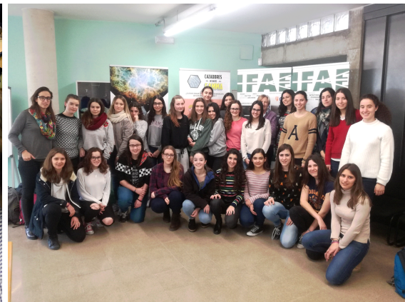
Figure 2: Group picture from 2017 at IFAE Barcelona

In 2018, when February 11 was a Sunday, Masterclasses for girls were offered on Monday, February 12. Eight research labs participated and organized Masterclasses with a total of 250 students [9]. The next year, 11 research labs organized Masterclasses on IDWGS, of which 9 were targeting girls only. 3 videoconferences with 7 female moderators were held to offer all groups a connection with female researchers at CERN [10].