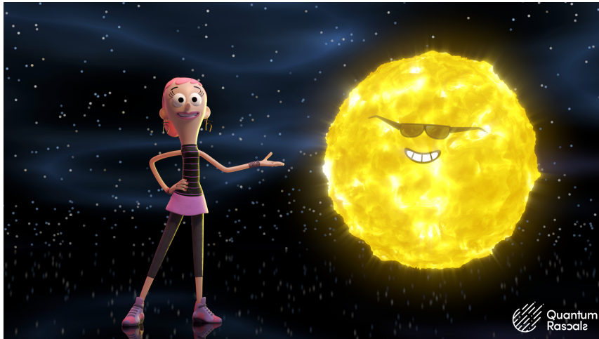
Figure 3: Do you know where the sun gets its energy from? Have a look inside the sun with Quantum Kate. From Quantum Kate: Sunshine [3].