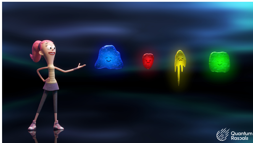
Figure 2: The four forces of the Standard model of particle physics. From Quantum Kate: The Standard Model [2].

Fashion, like physics are two of Quantum Kate's main interests, and she is super happy to share her knowledge of physics with her followers. She introduces them to the quantum world as well as black holes, stars, dark matter, the standard model of particle interactions, etc. These are concepts that are considered hard to communicate. Quantum Kate's starting point is often taken from her everyday life. In about one minute she introduces us to the amazing wonders of the subatomic world. Currently there are 17 episodes and two more will be released soon.