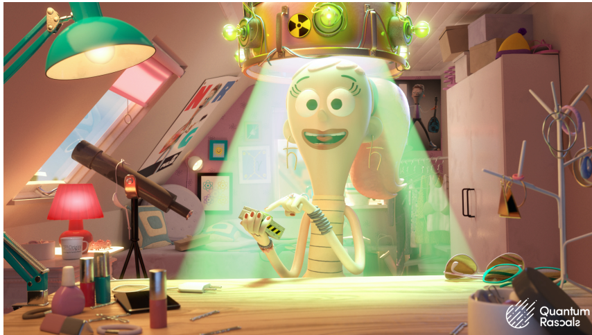
Figure 5: First time through the portal. From Quantum Kate: What atoms are made of [1].