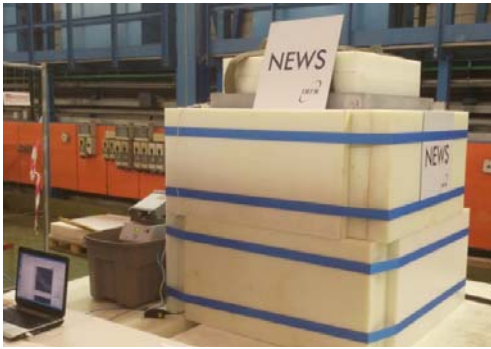
Figure 2: NEWSdm detector for pilot exposure in hall B of the Laboratori Nazionali del Gran Sasso

We plan to perform the first exposure with a target mass of 1 kg and the corresponding analysis of the data on a time scale of five years. During 2017 we performed a pilot exposure in order to confirm the estimations of the overall background budget of the experiment. A successful test was made in hall B of the Laboratori del Gran Sasso (LNGS) with 20 gr of NIT, shielded with lead and polypropylene blocks (Fig. 2). The next two years will be devoted to the construction of the infrastructures, the production of the emulsion target and of the detector shield. The exposure of 1 Kg detector is foreseen by the beginning of 2020 and will last one year. We plan to get first analysis results by the end of 2021. In figure 3 the 90\% C.L. upper limit, in case of null observation for an exposure of 1 kg x year of NIT emulsions, with a minimum detectable track length ranging from 200 nm down to 50 nm and in the hypothesis of zero background, is shown. Even not including the directionality discrimination of the signal and assuming to reach a negligible background level, such an experiment would cover a large part of the parameter space indicated by the DAMA/LIBRA results with a small (1 kg) detector mass, using a powerful and complementary approach.