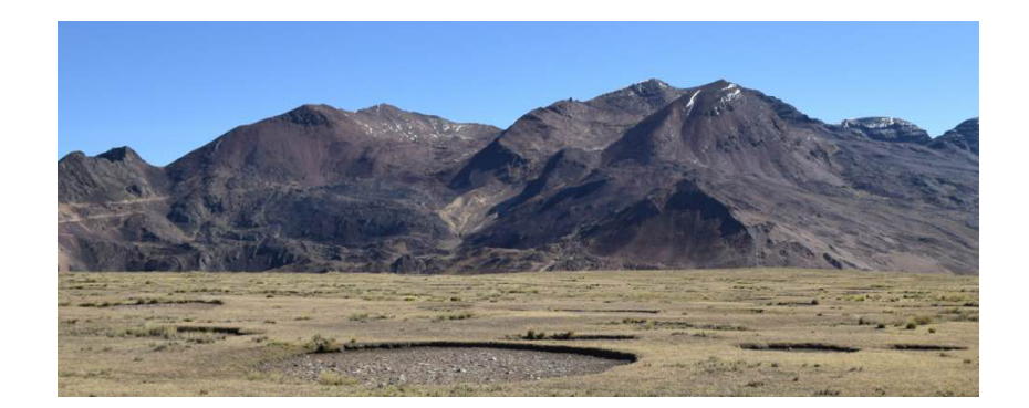
Figure 1: Experimental site for the ALPACA experiment, Chacaltaya Hill (4,740 m above see level, 16°23′ S, 68°08′ W), near Mount Chacaltaya, in Bolivia.