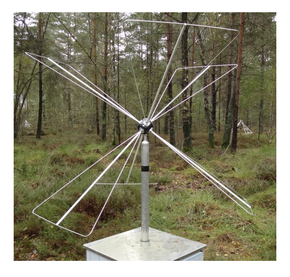
Figure 2: Picture of the 3D detector, whose location is indicated by the red star in FIG. 1.

The design of the 3D detector is based on three butterfly antennas with their LONAMOS LNA (Low Noise Amplifier) rotated twice around the NS and vertical axis. It is triggered by the SD and the three channels are recorded with a sampling rate of 100 MHz during 2.56 \mu s. A picture of the 3D detector is presented in FIG. 2. The results of this detector are presented in [16].