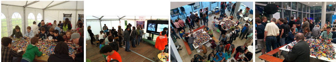
Figure 3: Impressions from various BYOPD events.

the infrastructure can be provided by BYOPD. While more details can be found in Reference [2], the basic idea is that participants are asked to design, build and name a "particle detector" (or whatever they think it looks like). They can enter the competition with an identifiable image of their design and by filling a form on BYOPD web site [3]. While the best and most witty models are selected based on picture and name at the end of the event and prizes are usually sent out by regular mail within the following weeks, every participant usually receives an immediate small reward (sticker, pen, button, ...) after registration.