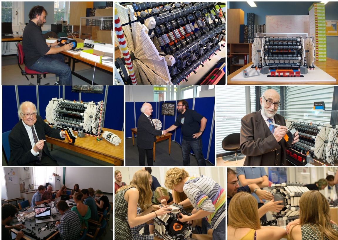
Figure 1: top: Impressions of the construction of the very first ATLAS LEGO model at NBI. middle: 2013 Nobel-laureates Peter Higgs and François Englert signing parts of the ATLAS LEGO model. bottom: Impressions of an outreach event with high-school students building the ATLAS LEGO model at NBI.

In contrast to large and detailed models, miniature versions – built from very few pieces and constructed by anybody in minutes – will not only create attention, but offer some amount of playability and serve as a long-term reminder when handed out as a souvenir or prize.