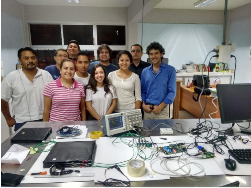
Figure 2: Participants of The Escarmujo course at the Universidad Autónoma de Chiapas, México, with the detector in the forefront.

laboratories and a minimum of equipment (oscilloscope, gloves, etc.). A map showing the visited institutions and the routed followed can be seen in figure 1. Figure 2 is a picture of the participants of the Escarmujo course at the Universidad Autónoma de Chiapas, Mexico. Table 1 compiles the information of the visited institutions, courses dates and local organizers.