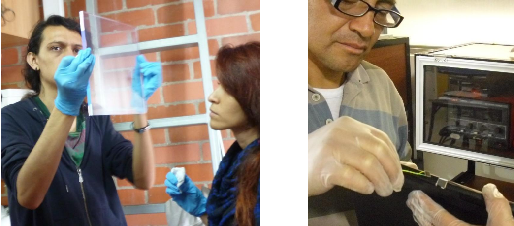
Figure 4: Left: two Physics student cleaning a scintillator plate before wrapping. Right: Professor Jaime Betancourt (Universidad de Nariño, Colombia) coupling the SiPM to the scintillator.

records the arrival time of the leading and trailing edges of the discriminator output, with 1.25 ns resolution. The CPLD allows the user to define the trigger logic (1- to 4-fold coincidence), record scalars of single channels and coincidence counts, define the discriminator thresholds, window gates, among other functions. When a trigger is fired, the system generates an event that contains the times of all the edges within the window gate referenced to a global timestamp. The DAQ card is powered with 5 V DC and has a 5 V fan-out connector to bias other devices.