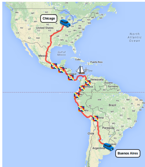
Figure 1: Map of the courses and the route followed.

The instrumentation schools organized in Latinamerican countries over the past decades (e.g. the ICFA instrumentation school series) have shown an increasing interest in Particle Physics detection technologies in the region. The strengthening of the participation of groups in experiments at first-class international facilities (such as CERN, Fermilab, Pierre Auger Observatory, etc.) and a thriving cohort of young Latinamerican experimentalists in the field is a clear accomplishment of those efforts. Detector and instrumentation schools can be a pivotal experience in the career of a student. Hence, aligned with these endeavors, we organized and lectured a series of them in the way of a drive from Chicago to Buenos Aires: the Escaramujo Project 1 .