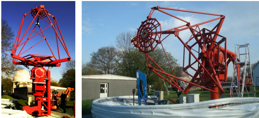
Figure 1: Mechanical structure of GCT (April 2015) with different elevation angles.

The complete and assembled mechanical structure is shown in Figure 1. The majority of the structural frame is made of standard carbon steel E355. Only the top dish is made of aluminium grade 6. The mechanical parts of the telescope are painted in red (RAL 3016) which offers the best compromise between the reduction of background light during gamma-ray observation and the solar radiation heating. An additional device is planned to clamp the telescope in its stow position, at 0^\circ , on the top dish. Final design of the telescope counts for a total mass of about 7.8 tons which is lighter than other SSTs [5].