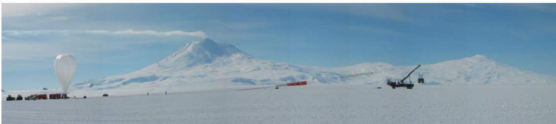
Fig. 1. View of pending balloon launch in Antarctica, with Mt. Erebus in the background.

Approximately 15-20 balloon experiments are launched each year from various locations: Ft. Sumner, NM; Kiruna, Sweden; Alice Springs, Australia; and McMurdo, Antarctica. Flight times range from several hours for launches in Fort Sumner, to several days for launches from Sweden to Canada, and from a couple of weeks to a couple of months for launches near McMurdo (Fig. 1) that circumnavigate Antarctica around the South Pole. The constant daylight means no day-night temperature fluctuations, so the balloon stays at a nearly constant altitude throughout the flight. Each balloon circles the continent from one to three times between launch and recovery. This opportunity is available for only 2-3 payloads per austral summer, so NASA is developing a Super Pressure Balloon (SPB) that would allow comparable durations at stable altitudes in mid-latitude regions for investigations that require nighttime exposure.