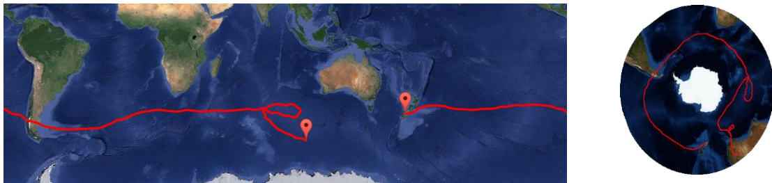
Fig. 3. (Left) Trajectory for first 18 days of the full 32-day SPB Trajectory (Right).

The second test flight launched March 26, 2015 from Wanaka, NZ was flown successfully for 32 days and nights of level flight (the long way around the globe) at nearly constant altitude of 109,000 - 110,000 ft. before being terminated April 28, 2015 over Australia (Fig. 3). The balloon carcass was recovered along with the 5,000 lb. test payload, and both were returned to the NASA Balloon Program Office at the Wallops Flight Facility (WFF) for detailed study. NASA had earlier obtained permission to land the SPB and its payload in Argentina, Australia, or New Zealand, or in the ocean if necessary. This flight authorization would presumably apply also to future launches from Antarctica or Wanaka, NZ. The Compton Spectrometer and Imager (COSI) payload flown on the truncated December 2014 SPB flight in Antarctica is currently planned for launch from Wanaka in April 2016. And, plans are underway to conduct a follow-on SPB test flight with the EUSO Balloon payload one year later in April 2017.