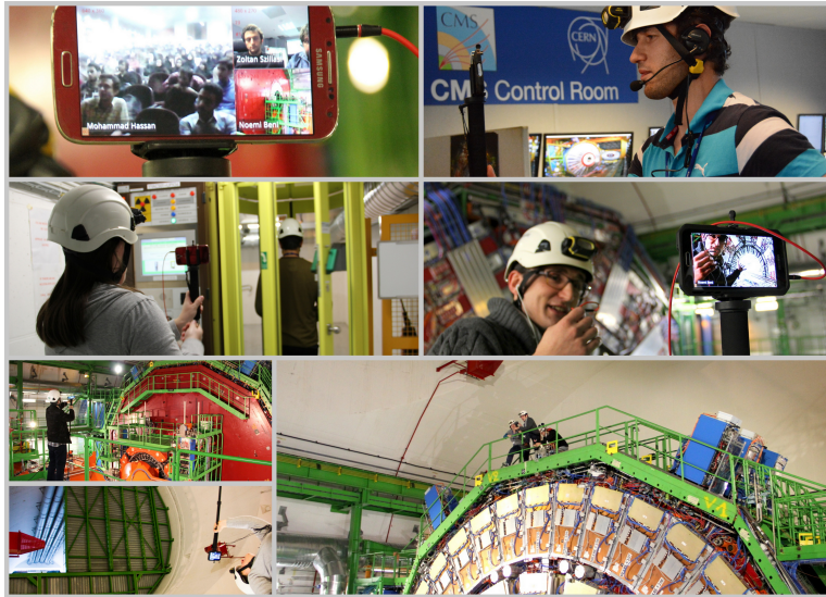
Figure 4: Clockwise from top-left: Mobile camera; CMS guide showing the Control Room; Passing through the iris scan to go 100 metres underground; Showing different angles of the CMS detector placed in its home cavern.