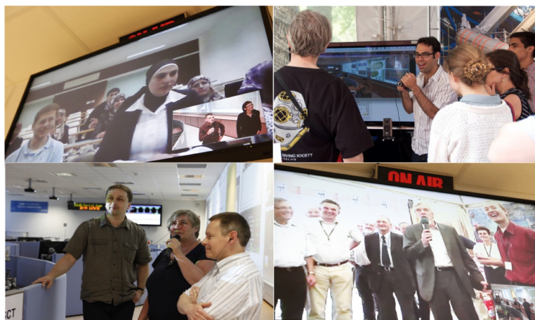
Figure 3: Clockwise from top-left: Visit from Birzeit University, Palestine; Visit from World Science Fair, New York City; CERN Director General.

Over the past six years, the ATLAS Control Room has hosted 227 visits from 40 countries and all seven continents. The project was recognised as “Best Online Event” by the Digital Communication Awards [14] in 2013 and was a finalist for the European Excellence Award in 2014 [15].