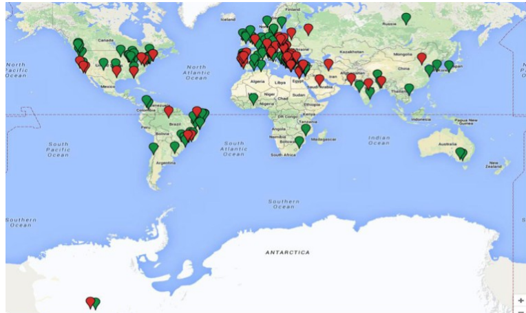
Figure 1: Map of the world showing ATLAS and CMS Virtual Visits connections. Green: ATLAS Virtual Visits; data from Nov 2010 - July 2015. Red: CMS Virtual Visits; data from Sept 2014 - July 2015.

Both teams observed that around 80% of the requests for Virtual Visits to ATLAS and CMS come from local contacts and events developed by the institutes that are part of the collaborations. Others were attracted by the collaborations' outreach programmes.