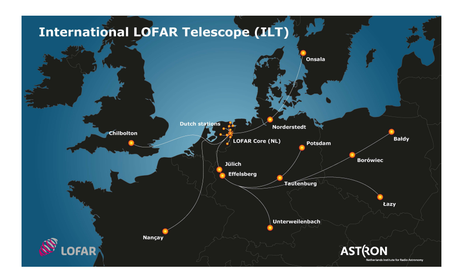
Figure 1: Locations of current and planned stations of LOFAR and the name of the international stations.