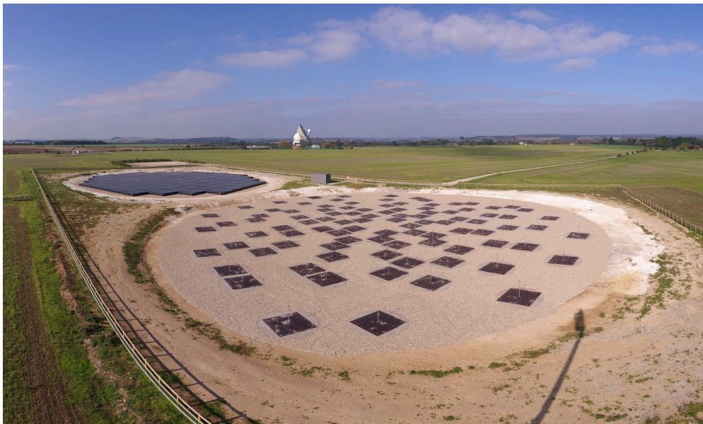
Figure 2: Station layout for the LOFAR station at Chilbolton, together with a photograph of the completed station. The LBA field is in the foreground, with HBA field behind it, and in the distance the Chilbolton radio dish, not part of the LOFAR station. The site building, including the LOFAR-UK control room (and ARTEMIS), is close to the dish.