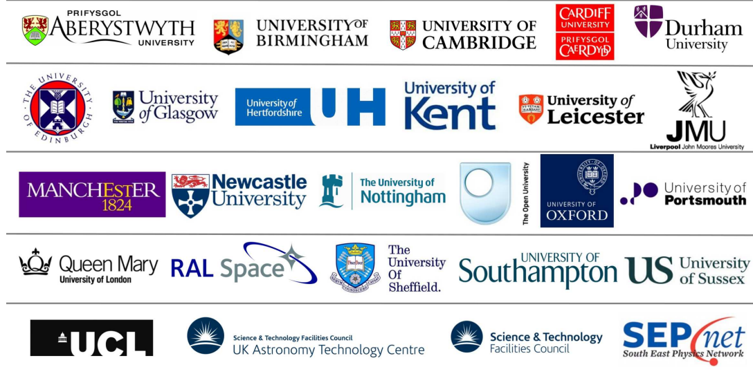
Figure 1: The institutional logos of the LOFAR-UK consortium, the largest Astronomy consortium in the UK.

Funded by the LOFAR-UK consortium comprising: