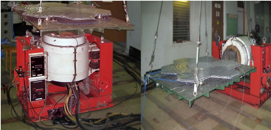
Fig.2. Space qualification tests of the technological Fresnel mirror

A set of the program packages for TUS are producing including the event simulation with expected optical parameters, programs for on-board data processing and off-line physical analysis. A special attention is given to measurements of the Fresnel mirror system for an evaluation of systematic uncertainties in the data.